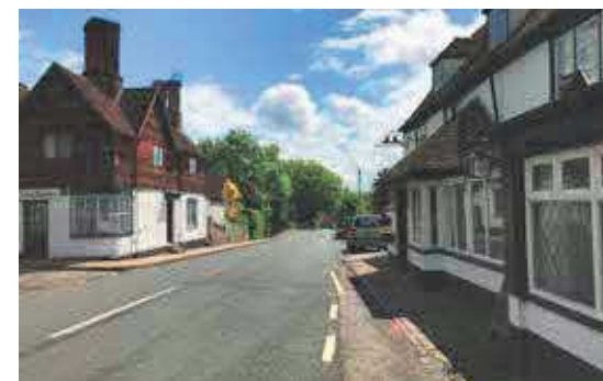
Figure 1: Streetscene from the village centre.