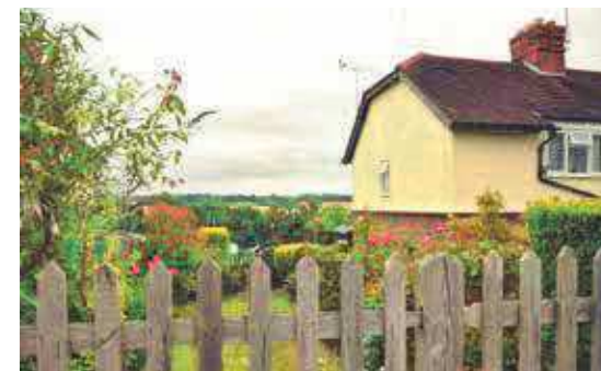
Figure 3: Long distance views towards the country side.