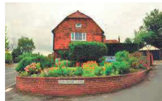
Figure 2: Typical facade rendering, red brick and shingles.