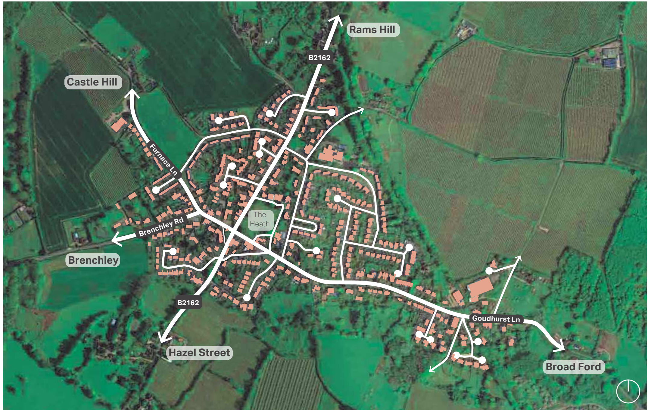
Figure 6: Horsmonden village centre plan, aerial image base.