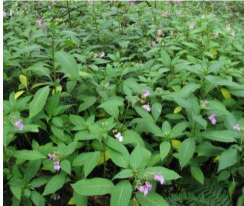
Himalayan balsam Probably the species you are most likely to see