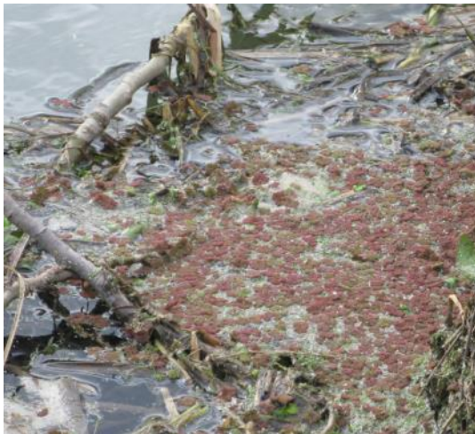
ABOVE: Azolla . An alga that can choke ditches. RIGHT: New Zealand pygmyweed . This very invasive species is banned from sale in the UK.