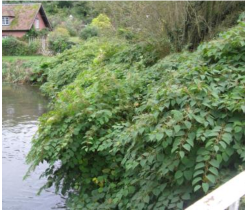
Japanese knotweed Can also cause damage to buildings.

These are plants or animals which are not native to Britain and can take over natural habitats. Some aliens like to grow in or near ditches or rivers. If you see any of the plants in these pictures, please report them to your local council (contact details inside).